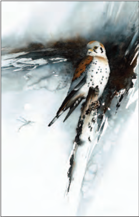
Best of Show ~ "Watchful Eye" by MARGARET WEBB