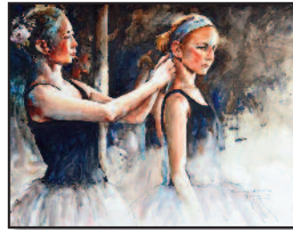
"Backstage Adjustments" by Bev Jozwiak