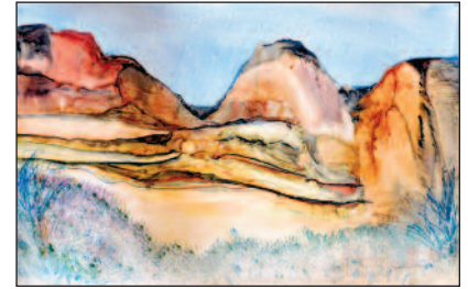
Sample of Yupo Landscape Paintings (Linda Aman)