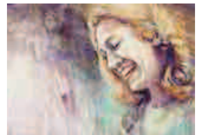
TREADING SOFTLY AMONG OLD SOULS