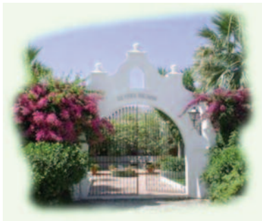
La Finca del Niño, Andalusia, Spain