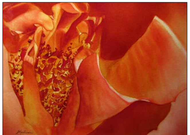
Honorable Mention - SHEILA MARTINSON "Drawn Within"