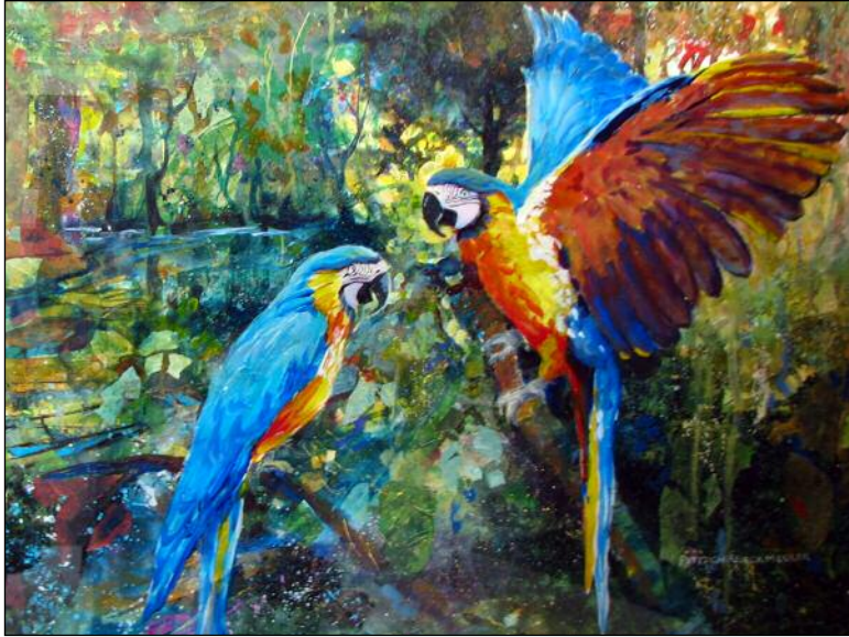
1st Place - PATTI CHILBECK MEULER "Proud Feathers"