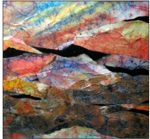
2nd Place - KATEY SANDY "Far Away Thoughts"